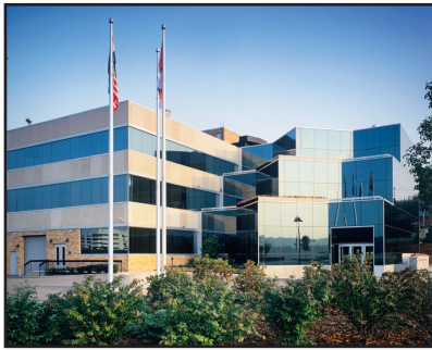
Croatian Fraternal Union of America Founded in 1894 Periodicals Postage Paid at Pittsburgh, PA