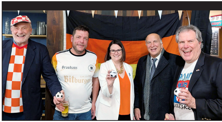
CROATIAN COMMUNITY LEADERS gather at Brauhaus Schmitz to celebrate Croatia and France and spotlight the "How Do You Phan" fan initiative ahead of the 2026 FIFA World Cup.