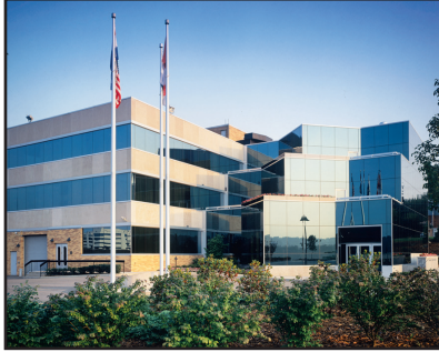
Croatian Fraternal Union of America Founded in 1894 Periodicals Postage Paid at Pittsburgh, PA

POSTMASTER: Send address changes to Zajedničar , 100 Delaney Dr., Pittsburgh, PA 15235