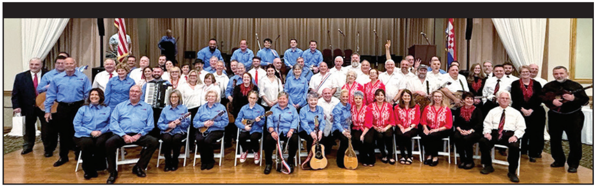
POST CONCERT PHOTO OF HOOSIER HRVATI and guest groups: DTO, HRVATSKI OBIČAJ, PRIJATELJI. The Red, White and Blue is stunning!