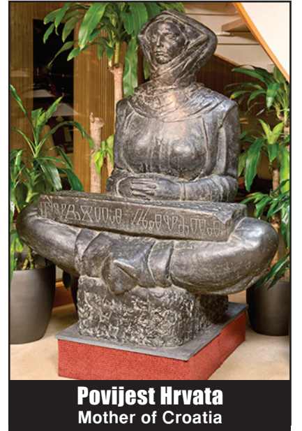
Povijest Hrvata Mother of Croatia